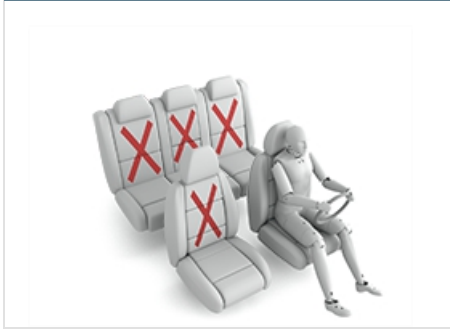
BeSafe iZi Kid X3 ISOfix (ISOFIX)